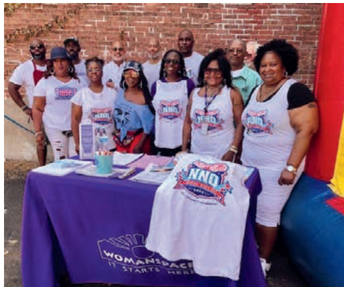
Trenton Community members at the Womanspace table.