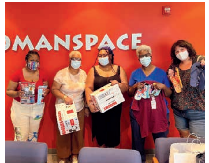
Shalom Missionary Baptist Church in Mt. Holly donated flip flops, baby supplies, and personal hygiene products.