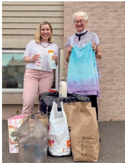
Holy Apostles Episcopal Church donated new clothes and personal hygiene products.